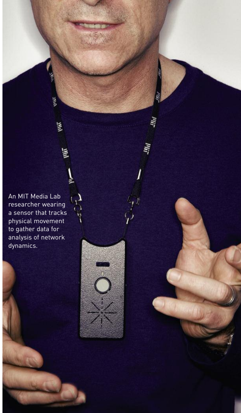
An MIT Media Lab researcher wearing a sensor that tracks physical movement to gather data for analysis of network dynamics.